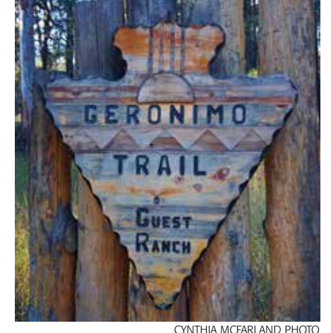
The entrance to Geronimo Trail Guest Ranch. The ranch is surrounded by towering pines in three million acres of wilderness areas and national forest land.

and Butch Cassidy and the Sundance Kid once rode to stay ahead of the law. It was a thrill to ride here.